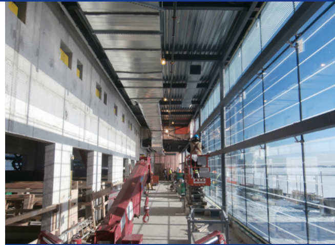
Interior of mainland pavilion