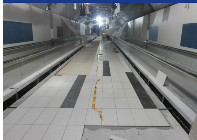
Tile installation underway inside the pedestrian tunnel