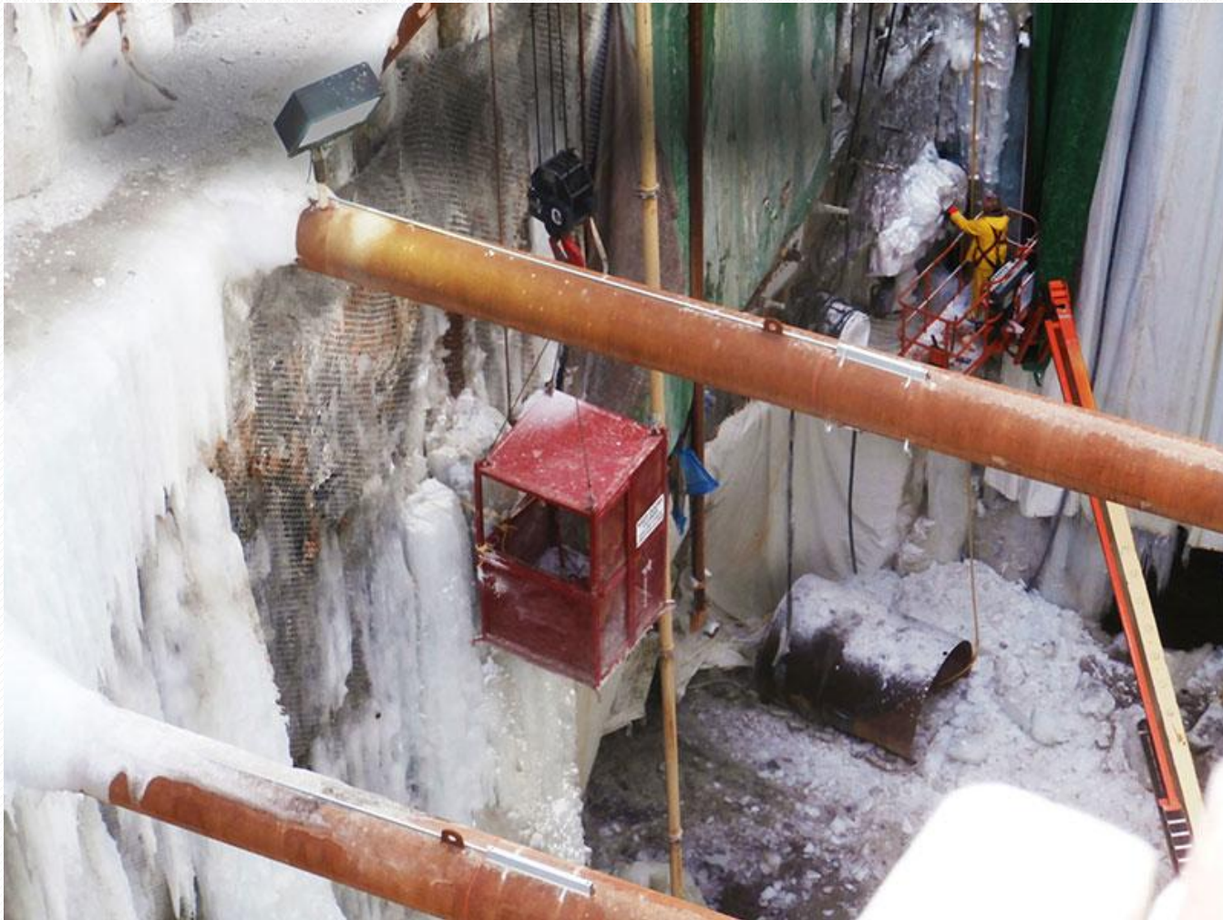
Ice Removal in Shaft